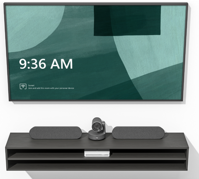
Logitech RoomMate shown with Rally Plus system